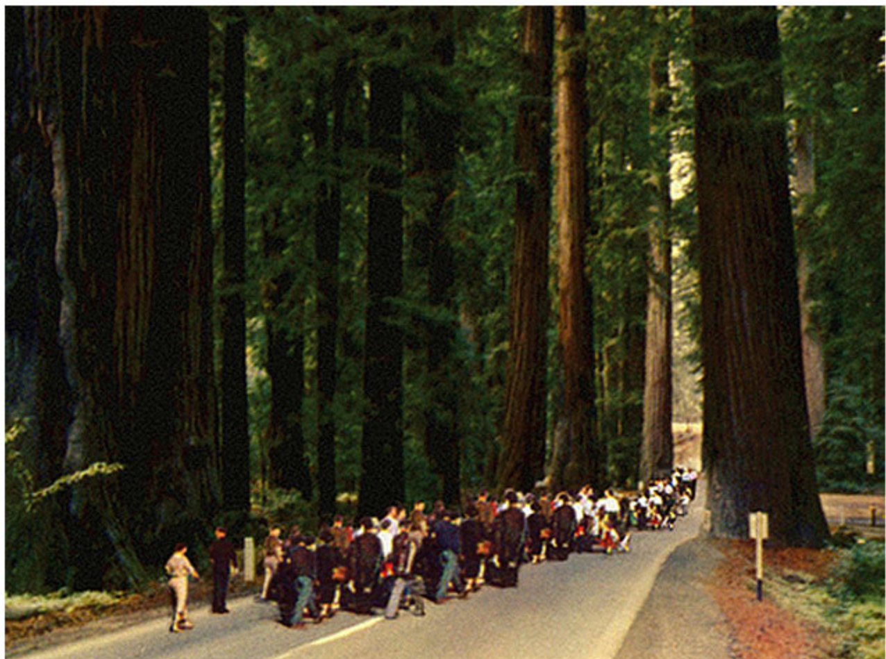
Mark Mann, Long Highway, 2003

mark mann Small text below the collage, likely a caption or description of the images.